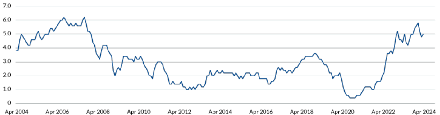
Percentage changes in the 7520 rate over time