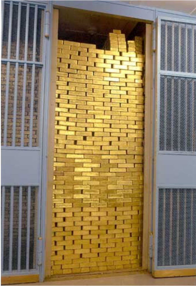
Gold vault, Federal Reserve Bank of New York