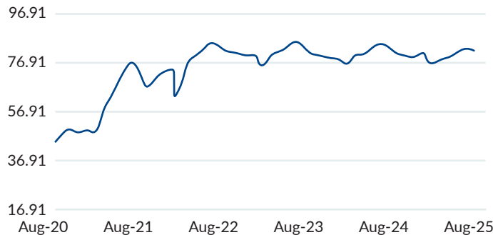
CHART 5: LOAD FACTOR (LAST 5 YEARS; ALL CARRIERS)

Past performance is not indicative of future results.