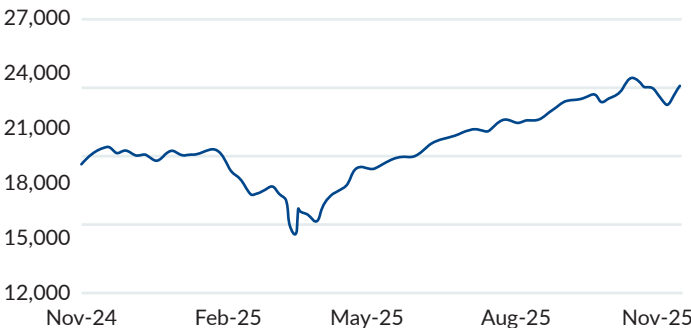
CHART 2: NASDAQ (LTM)

Past performance is not indicative of future results.