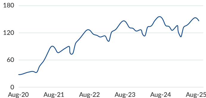
CHART 4: REVENUE PASSENGER-MILES (LAST 5 YEARS; ALL CARRIERS)

Past performance is not indicative of future results.