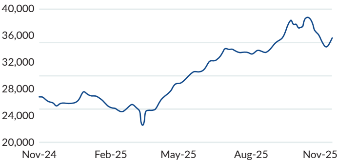
CHART 3: S&P SELECT INDUSTRY: AEROSPACE & DEFENSE (LTM)

Past performance is not indicative of future results.