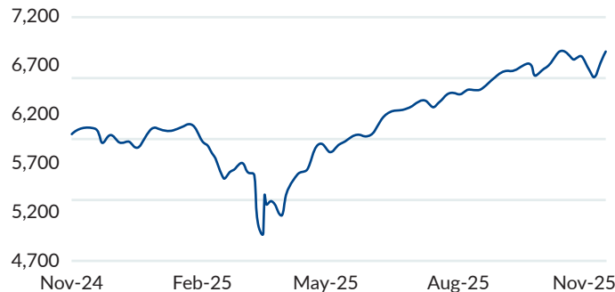
CHART 1: S&P 500 PERFORMANCE (LTM)

Past performance is not indicative of future results.