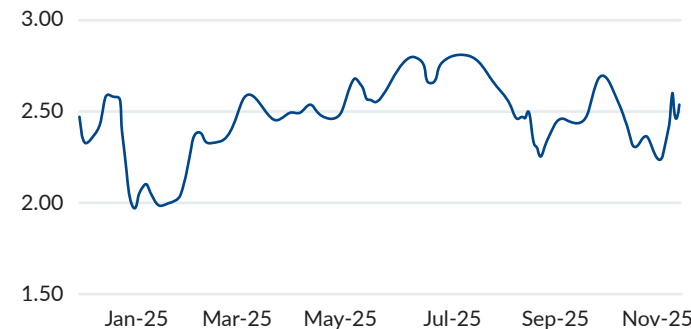
CHART 6: US TSA CHECKPOINT DATA (IN MILLIONS) (LTM)

Past performance is not indicative of future results.