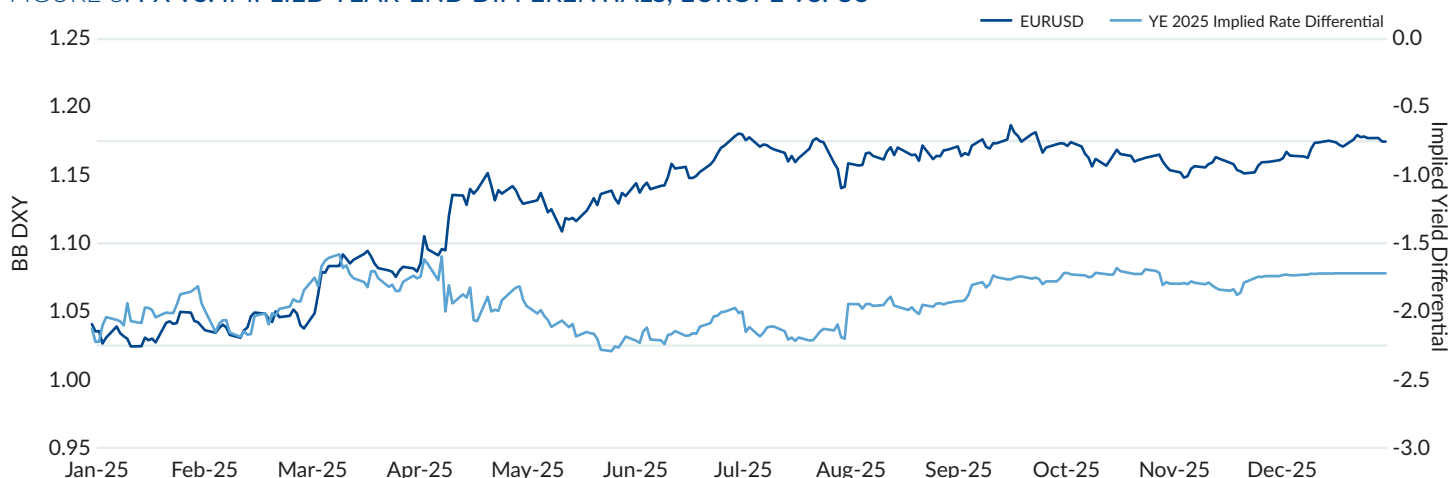
FIGURE 3: FX VS. IMPLIED YEAR-END DIFFERENTIALS, EUROPE VS. US

A third anomaly emerged in interest rate differentials. FX markets have historically tracked relative yield expectations, as investors seek higher returns across jurisdictions. Prior to Liberation Day, EURUSD closely followed implied year-end rate differentials between the ECB and the Fed. Post-Liberation Day, however, the relationship inverted with the Euro strengthening relative to the dollar, despite rate differentials continuing to favor the US. This divergence persisted into year-end.