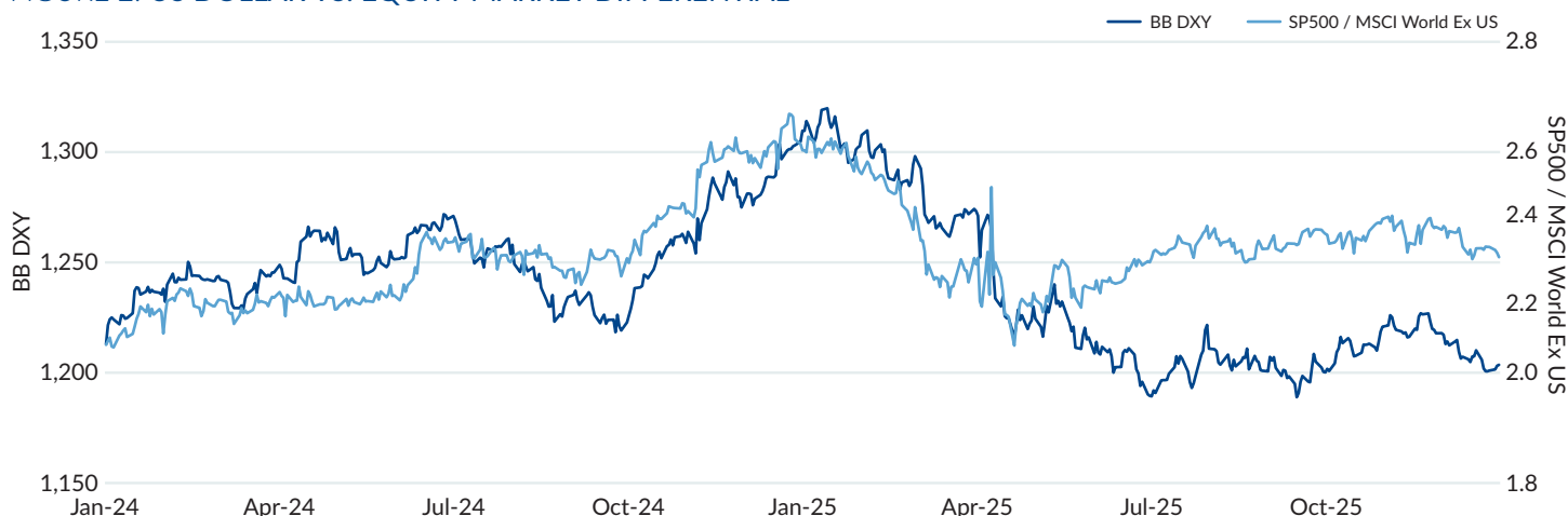
FIGURE 2: US DOLLAR VS. EQUITY MARKET DIFFERENTIAL

Despite a recovery in US equities, the dollar failed to appreciate, instead weakening throughout the first half of the year, suggesting a reluctance among global investors to add incremental US exposure amid the “Sell America” backdrop.